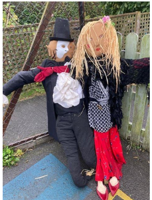
Our winning scarecrow—The Phantom of the Opera!